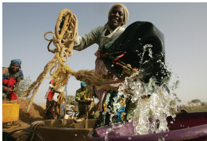
Fetching water in Niger.

Ph: +1.845.680.4464 Fx: +1.845.680.4864 www.iri.columbia.edu