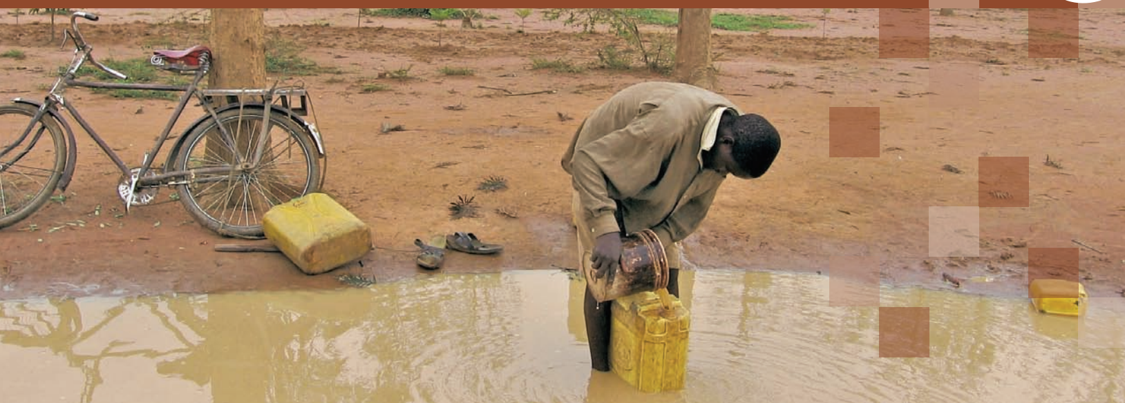
The Earth Institute

Climate-sensitive problems are by their nature complex, interconnected and time sensitive. Experience to date has made it clear that useful information can't be developed apart from an understanding of the target problem. Furthermore, the utility of additional scientific inputs requires consideration of available resources, practices, culture and the pathways through which decisions occur. Solutions are often limited by a lack of institutional coordination and by gaps in communication, information, education or knowledge management. The box below details ways in which these gaps can be bridged.