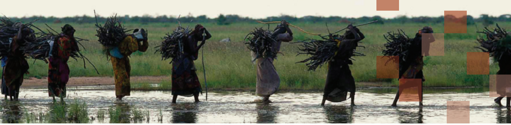
Somali refugees displaced once more as Tana River floods.

The 'no regrets' aspect of CRM means making decisions and taking action that not only address a specific climate threat but also make sense in development terms. Even if the climate threat never materializes, the development agenda still moves forward.