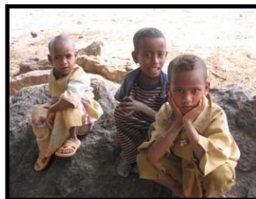
Children in Adi Ha

The final component of the HARITA model involves prudent risk taking, primarily in the form of credit for purposes of livelihood diversification (e.g. honey production), technology adoption (e.g. high-yield seed varieties, irrigation), and entrance into more profitable lines of business (e.g. producing high value horticultural crops like spices and vegetables). With insurance in hand, poor producers can make potentially optimal production decisions even in the face of uncertainty, meaning they can afford to plant high-yield seeds purchased on credit despite the uncertainty of future precipitation levels. Insurance serves as a partial guarantee for banks and microfinance institutions that are reluctant to make substantial unsecured loans for inherently risky agricultural activities. In this way, insurance has the potential to reduce the interest rate on lending as well.