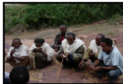
Community Members of Pilot Design Team

Farmers in Adi Ha have been central participants in the design of the weather index insurance package by contributing ideas, feedback, and advice. Toward that end, a team of five community members were elected by their peers to join the “Pilot Design Team” to manage the initiative. In addition, a focus group of 21 farmers participated in a number of test workshops on climate change, financial literacy, and insurance. In addition, IRI conducted experimental economic risk simulations and focus group discussions with farmers to understand their preferences for key parts of the insurance contract, such as coverage levels and frequency of payout. What we learned through this process of engagement resulted in a much more attractive product, and improved the financial service providers' ability to educate farmers effectively. HARITA's emphasis on farmers' interests differs from the dominant model of product design that revolves primarily around the interests of lenders and insurers.