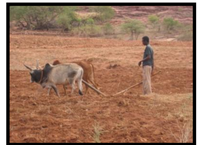
Farmer in Adi Ha

Oxfam America (OA) has convened Ethiopian farmers, Swiss Re, the Relief Society of Tigray (REST), the International Research Institute for Climate and Society (IRI), Nyala Insurance, and over a half dozen other organizations to launch an innovative climate change resiliency project called “Horn of Africa Risk Transfer for Adaptation” (HARITA). Together, over the last year and a half, we have worked on designing a risk management package for farmers in the village of Adi Ha, located in Ethiopia’s northernmost state of Tigray. The project has broken new ground in the field of climate change resiliency and microinsurance by addressing the needs of smallholder producers through an unusual mix of risk reduction, drought insurance, and credit. Under the HARITA risk management package, insurance complements disaster risk reduction and long-term, sustainable investments in agriculture.