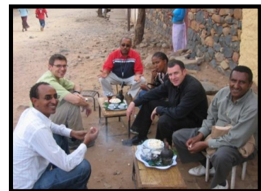
Local partners and technical advisors