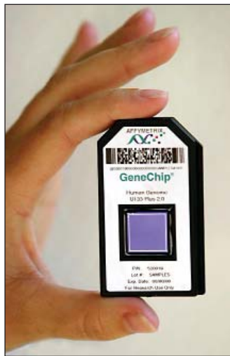
At a glance. Microarrays, such as Affymetrix's GeneChip (above), now include all known human genes.