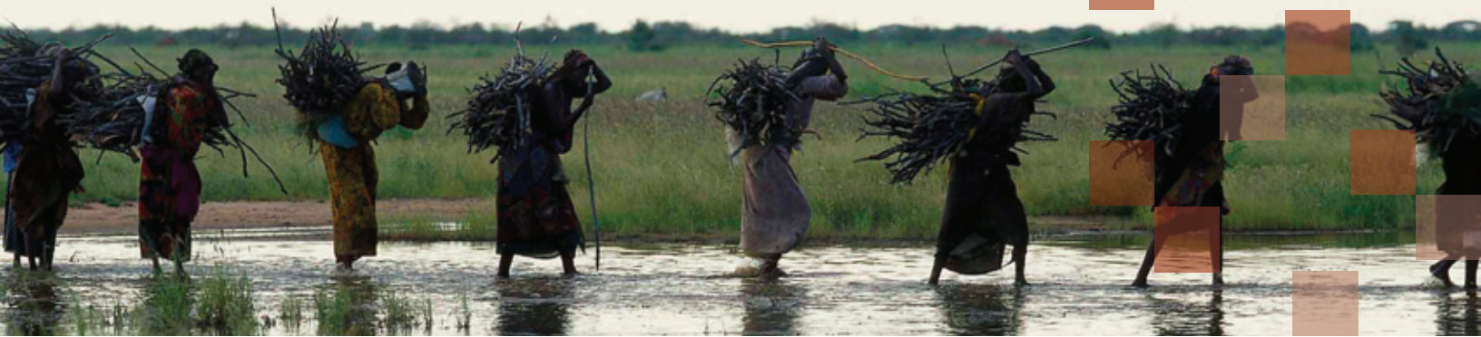
Somali refugees displaced once more as Tana River floods.

The 'no regrets' aspect of CRM means making decisions and taking action that not only address a specific climate threat but also make sense in development terms. Even if the climate threat never materializes, the development agenda still moves forward.