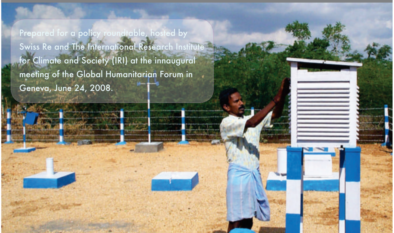
Meteorologist checking instruments at the Sundakkam Palayam meteorological station, Avinashi, Coimbatore district, Tamil Nadu, India. Photo by Holger Meinke, September 2000.

Prepared for a policy roundtable, hosted by Swiss Re and The International Research Institute for Climate and Society (IRI) at the inaugural meeting of the Global Humanitarian Forum in Geneva, June 24, 2008.